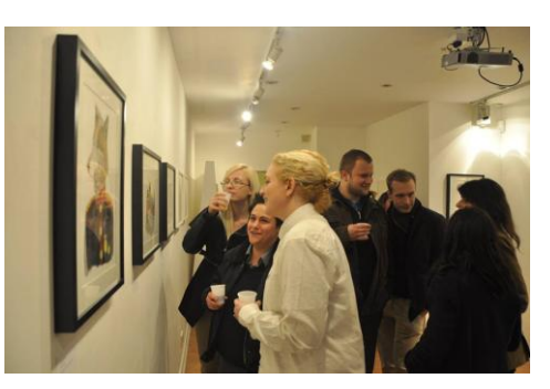
Illustrator Misha Zaccours exhibition