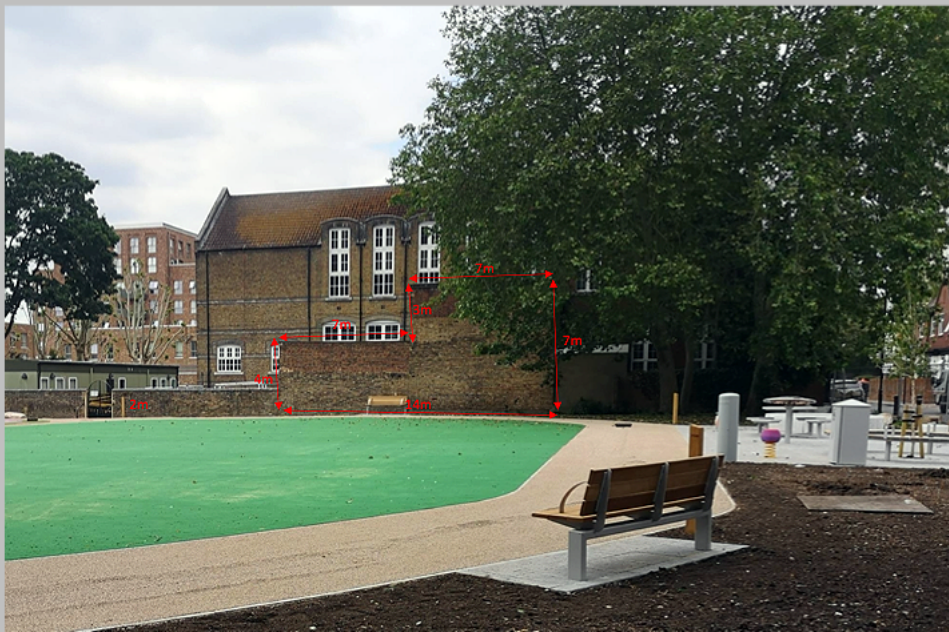
Bollo Brook Park – Berrymede Junior School walls